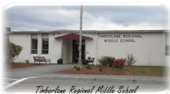
Timberlane Regional Middle School