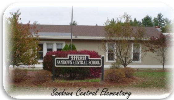
Sandown Central Elementary