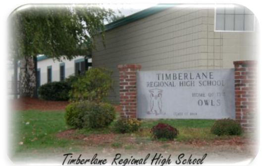
Timberlane Regional High School