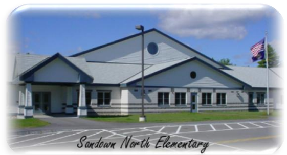
Sandown North Elementary