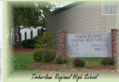
Timberlane Regional High School