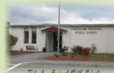
Timberlane Regional Middle School