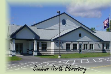
Sandown North Elementary